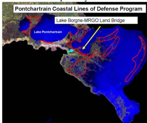
Figure 1: Location of the Lake Borgne-MRGO Land Bridge preservation and restoration project. Project includes shoreline protection along the Golden Triangle and for narrow reaches of the land bridge. This project is one ten projects in the Pontchartrain Coastal Lines of Defense Program.

The final CHMP is a federally approved plan by the EPA Region VI office. The Coalition to Restore Coastal Louisiana and the Louisiana Wildlife Federation have passed resolutions endorsing both the Comprehensive Habitat Management Plan and the Pontchartrain Coastal Lines of Defense Program. Since its release, the Pontchartrain Coastal Lines of Defense Program has been presented to numerous parish, state and federal officials. It is also publicly accessible on the web.